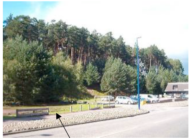
Fig. 2 – Site (immediate foreground) as viewed from Grampian Road

4. The applicant seeks permission to have this condition altered to allow the commencement of development to be delayed for a further period of 15 months. This would allow for an opportunity to allow market conditions to improve and provide for better probability of a commercially successful development.